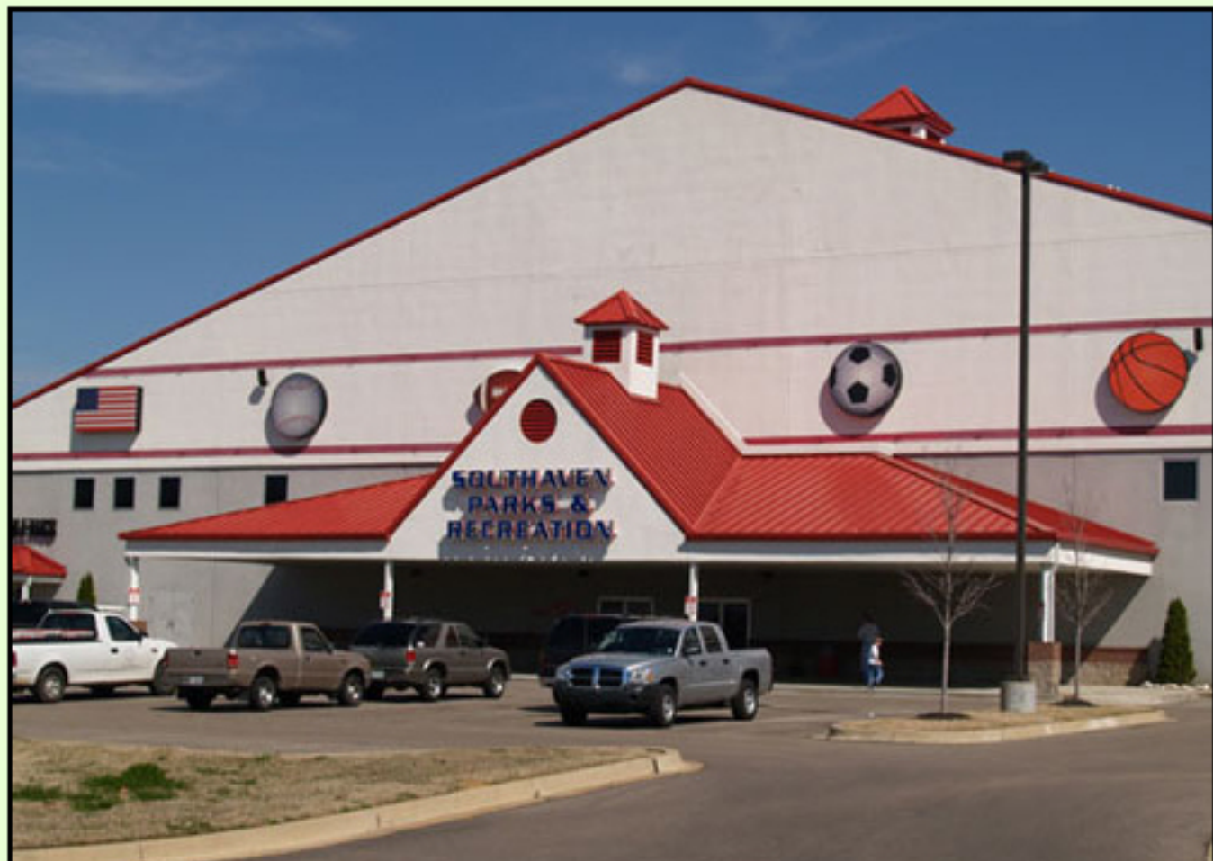
Southaven Parks & Recreation - Southaven, MS